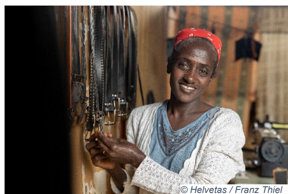
Youth garment enterprise member