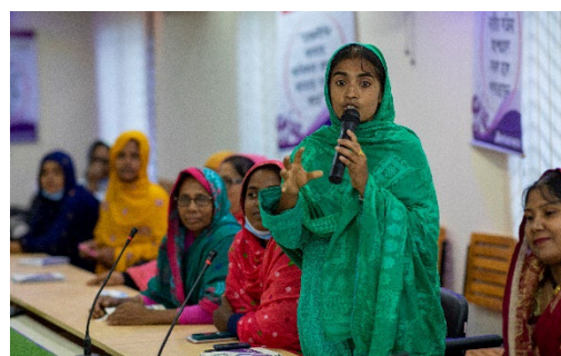
Member from Aparajita forum