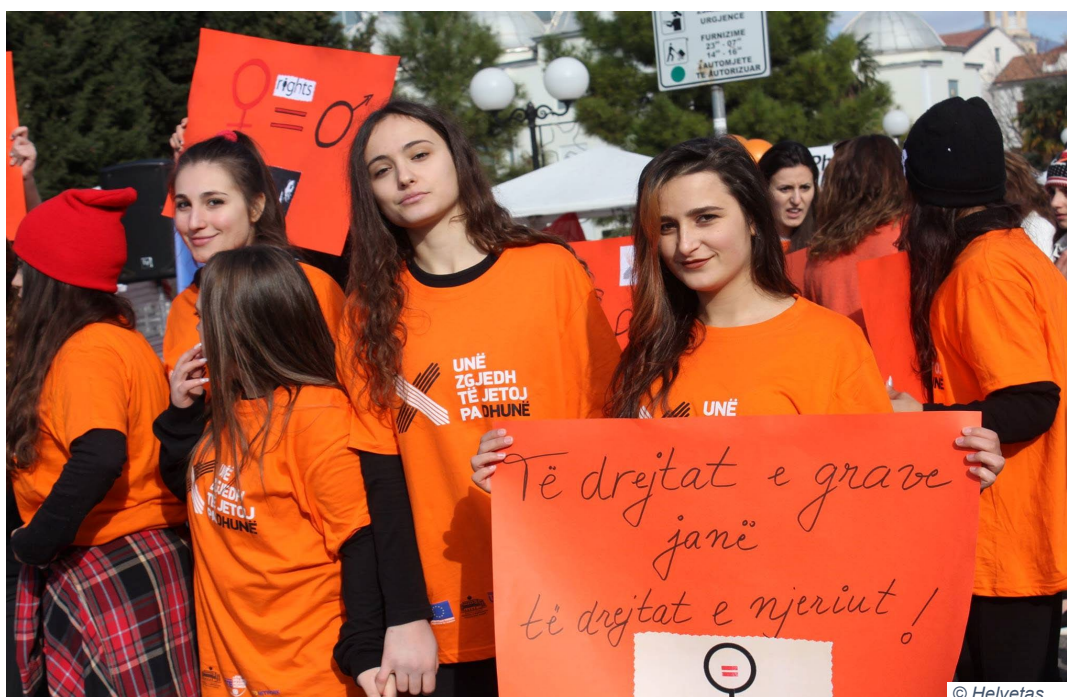
Young women standing up for equal rights in Albania